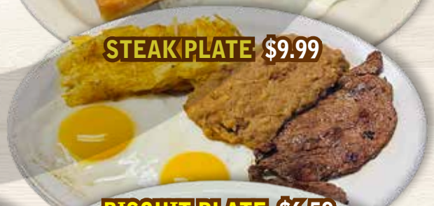
STEAK PLATE $9.99