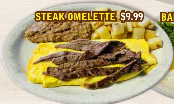
STEAK OMELETTE $9.99