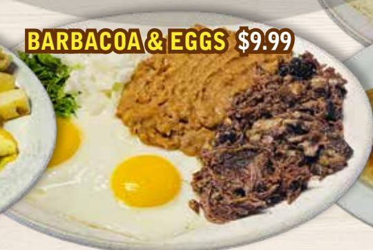
BARBACOA & EGGS $9.99